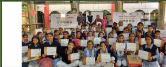
Caption: A HOPE FULFILLED We strive for a utopic tomorrow, These countless bright faces are proof, Of this essence shining through