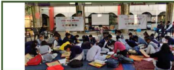
Caption: A WILL FOR A BETTER TOMORROW As students today are leaders tomorrow, Seeds of compassion when sown, inspire awareness anew