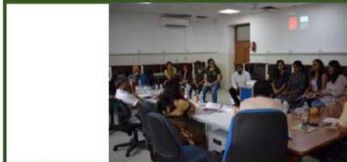
Caption: KNOWLEDGE IS REVIVED Boundless knowledge from all visionaries finally imparted , students from the University deliberated, ideated and formulated effective responses .