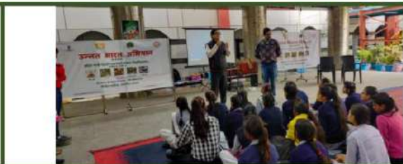
Caption: WHEN FAITH STRENGTHENS UBA Pioneer programme for the rural fabric that's everchanging, brought to fruition with sweet symphony involving community.